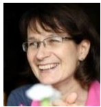
Dr Jenny Harries (South of England)